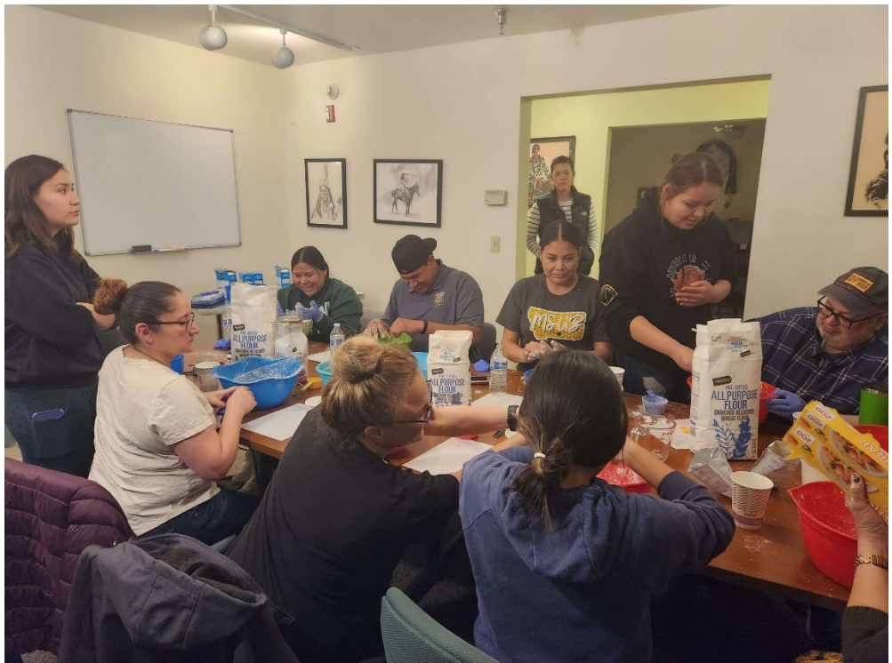
Photo Caption: All Nations hosted a fry bread workshop for the campus, February 2023