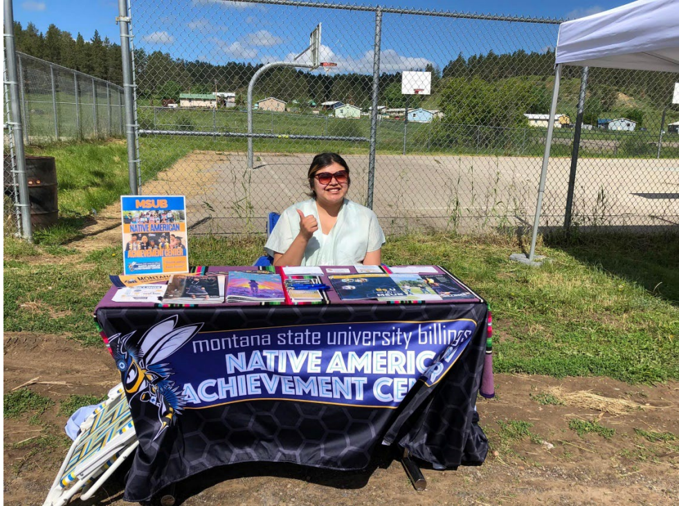
Photo File Name: GameNight.jpg Photo Caption: Game Board Night, September 7, 2022 Photo Credit: Amber Peretz

Photo File Name: Lamedeerhealthfair.jpg Photo Caption: Lame Deer Indian Health Service Health Fair. June/2022 Photo Credit: Amber Peretz