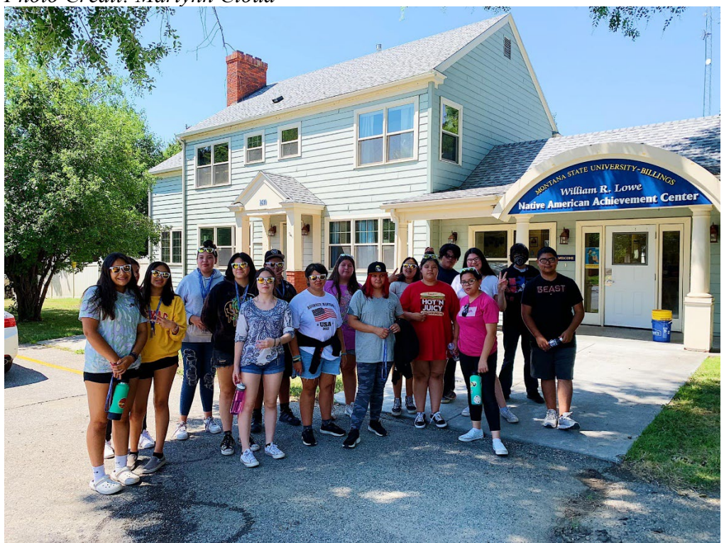
Photo File Name: Pre.Orientation.jpg Photo Caption: Pre-Orientation for Incoming Students & Families. June/2022

Photo File Name: HS101 Photo Caption: Billings School District, High School 101 Summer of 2022. June/2022