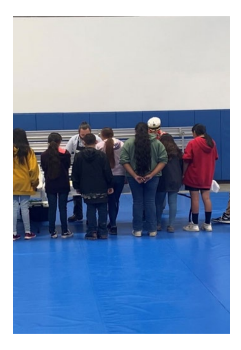
Photo File Name: stem.jpg Photo Caption: STEM workshop science in art activity at Little Big Horn College 5/16/23