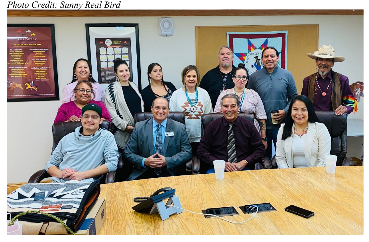
Photo Caption: MSU Billings & Fort Peck Community College Administration, September 14, 2022