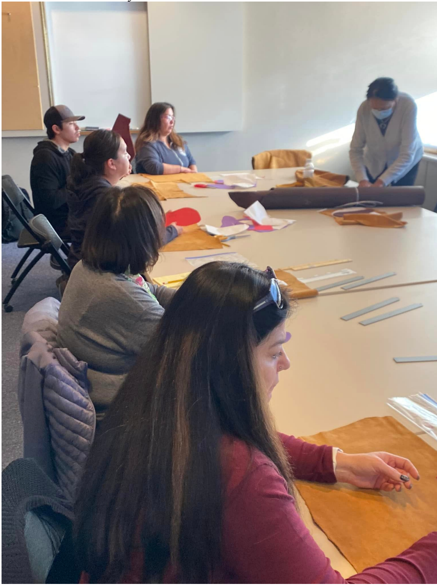
Photo File Name: Moccasinworkshop.jpg Photo Caption: SIAM Grant, moccasin workshop, February 2023