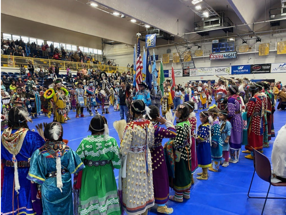
Photo Caption: 53<sup>rd</sup> Annual MSU Billings Powwow, April 22<sup>nd</sup>, 2023, Grand Entry