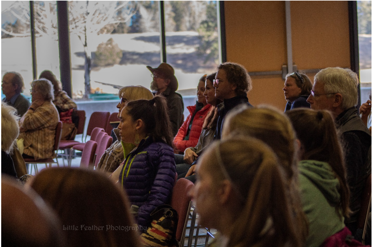
Photo File Name: 2020 Symposium Audience1, 2/29/2020

12. Do you have any suggestions on how to improve the Governor's Tribal Relations Report?