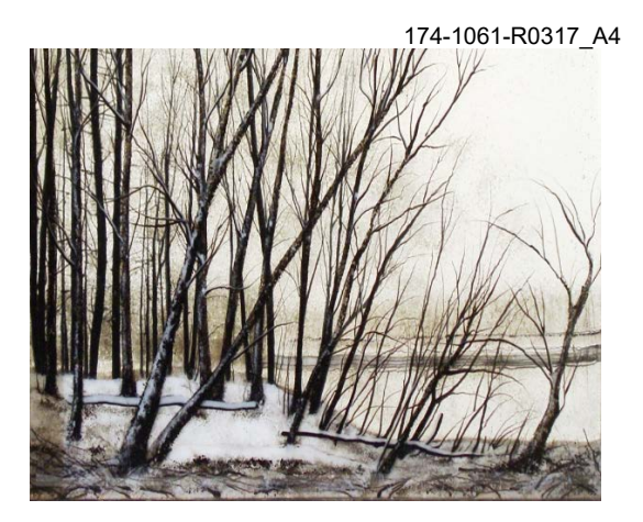
Fusing: Miriam di Fiore