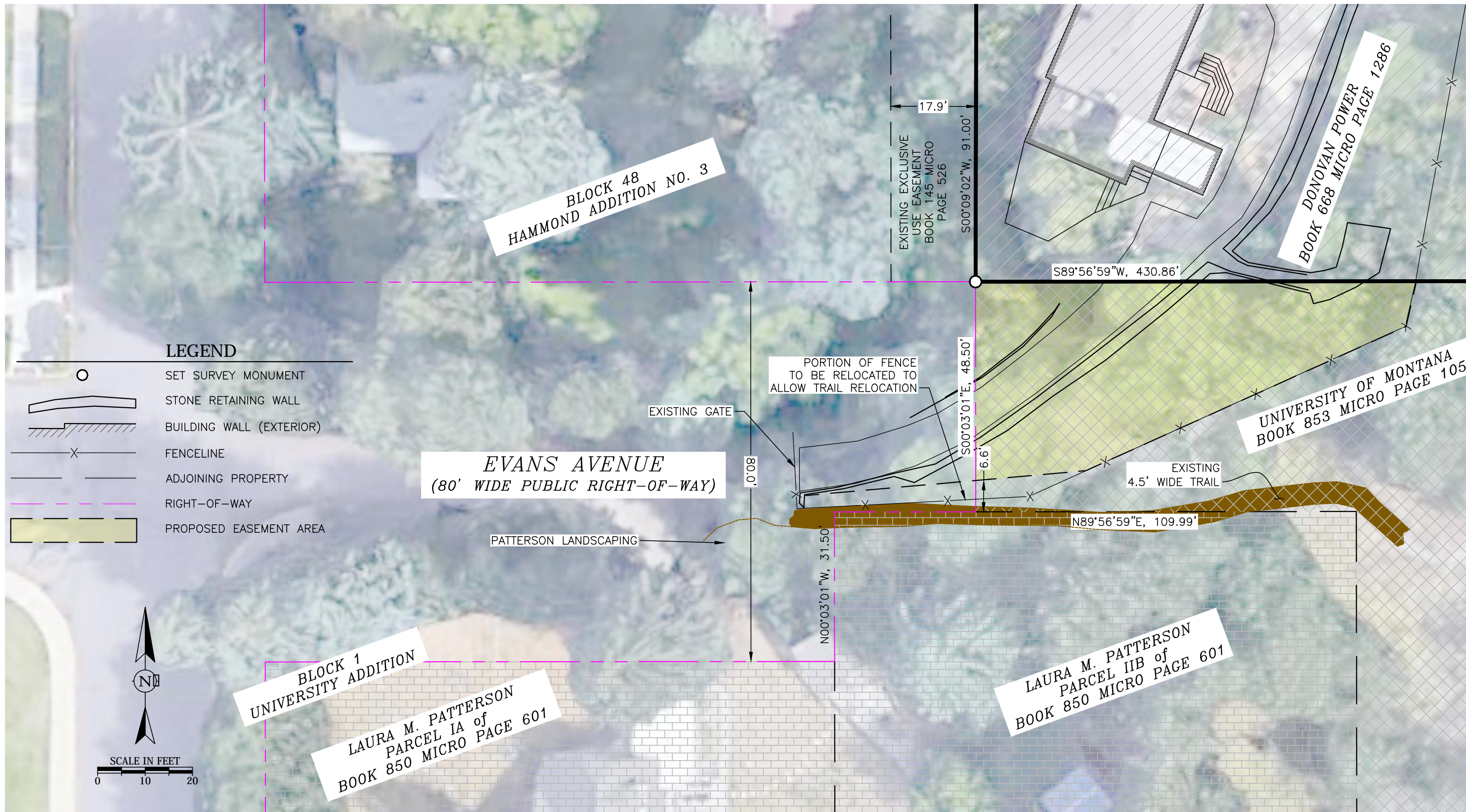
EXHIBIT - EXISTING CONDITIONS (REVISED APRIL 14, 2020)