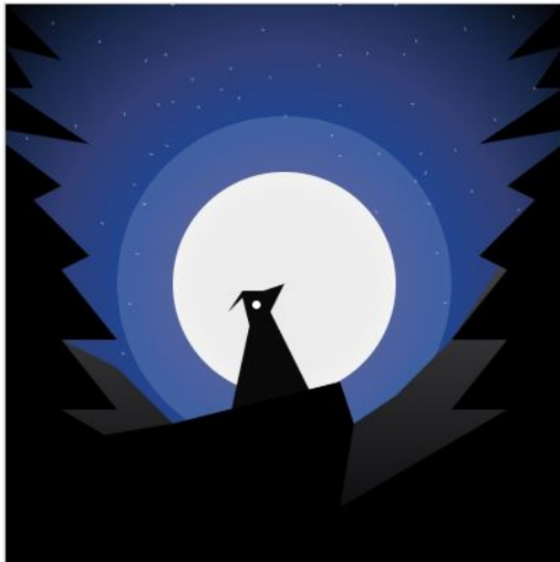
Wolf, designed by Aidan Wosoba