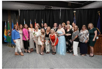
Bryant Graduation & Cosmetology Pinning

Congratulations to our incredible nursing team for preparing our students so well for their licensure exam! Our RN NCLEX pass rate is 100% for this year!