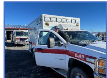
2012 Chevrolet Ambulance