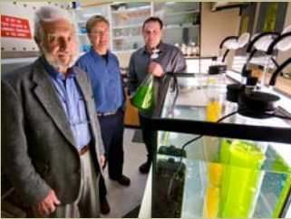
Montana's university scientists develop biofuels from algae