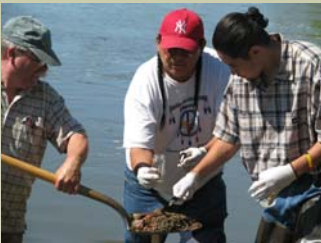
Students and faculty at Montana's Tribal Colleges lead water resource research