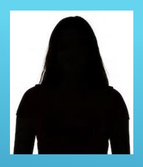
Brooklyn 1st Generation Low Socioeconomic Interest(s): Photography Character attribute: Creative, shy, child of a school employee